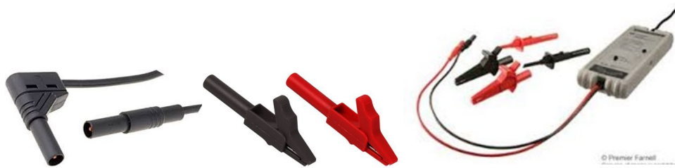
Insulated test wires / alligator clips and isolated differential probe