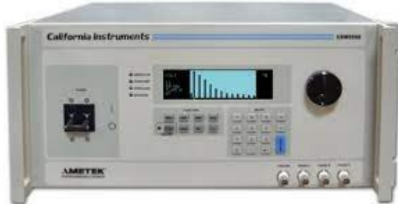
AC Power Source

In addition, there are requirements for a safety course that meets the standard EN50110.